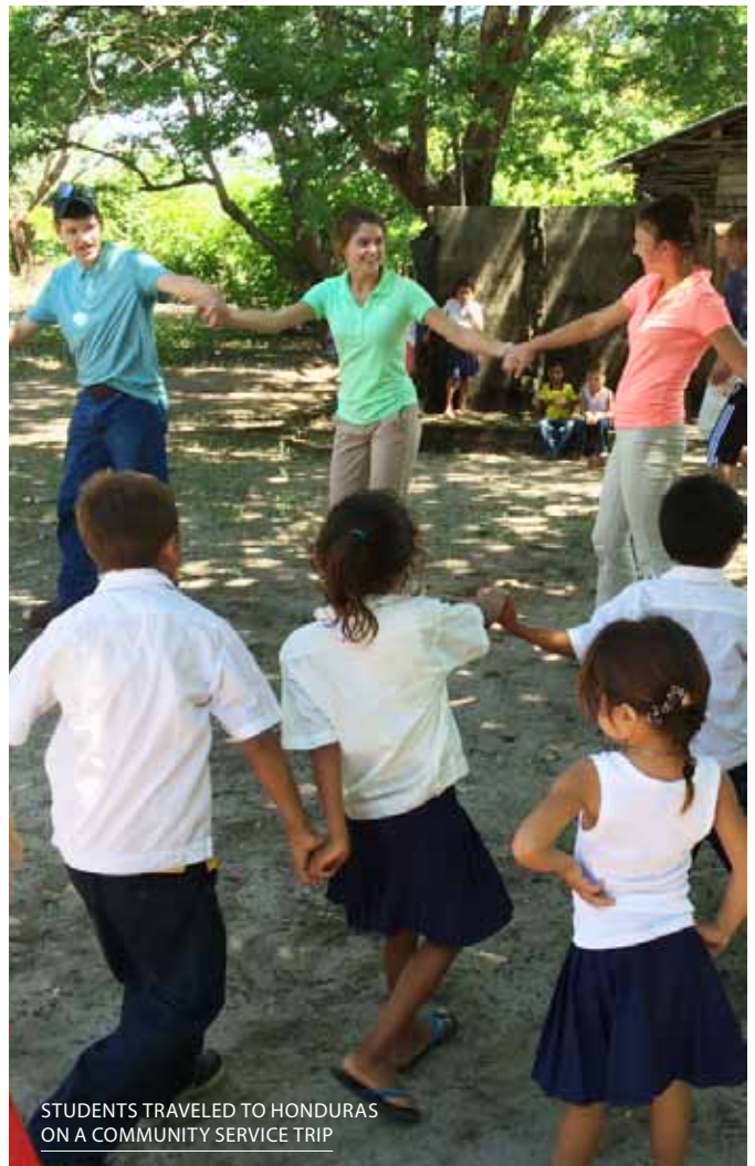
STUDENTS TRAVELED TO HONDURAS ON A COMMUNITY SERVICE TRIP

Our staff works hard to provide a wide variety of service learning activities in our schools because we know these activities help children gain the tools necessary for success both in and out of school. With the holiday season approaching when many service activities are going on, we thought it would be a good time to feature service learning in our schools.