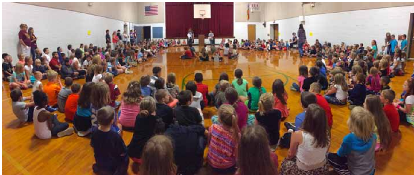
BELOW: AMESVILLE’S ALL-SCHOOL MEETING ABOUT FRIENDSHIP LED BY PEER MEDIATORS