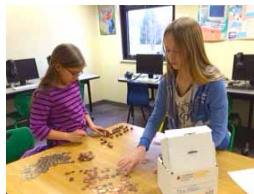
FROM LEFT: SIXTH GRADERS ASSISTING THEIR YOUNGER BUDDIES WITH HANDWASHING AND READING, PENNIES FOR PATIENTS, BUILDING PICNIC TABLES FOR MOVING UP DAY