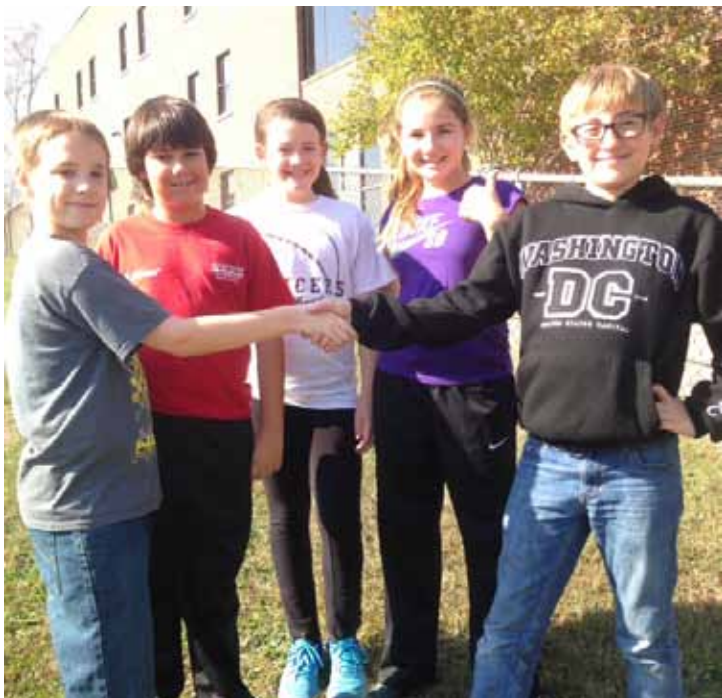
CLOCKWISE: MOVING UP DAY, EMPTY BOWLS FUNDRAISER ART, PEER MEDIATORS