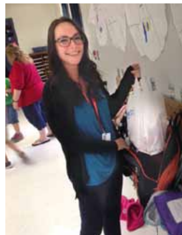
TOP: AMESVILLE STUDENTS PRESENT CHECK FOR FOOD BANK. ABOVE: FILLING BACKPACKS FOR COOLVILLE CARES FREE FOOD PROGRAM